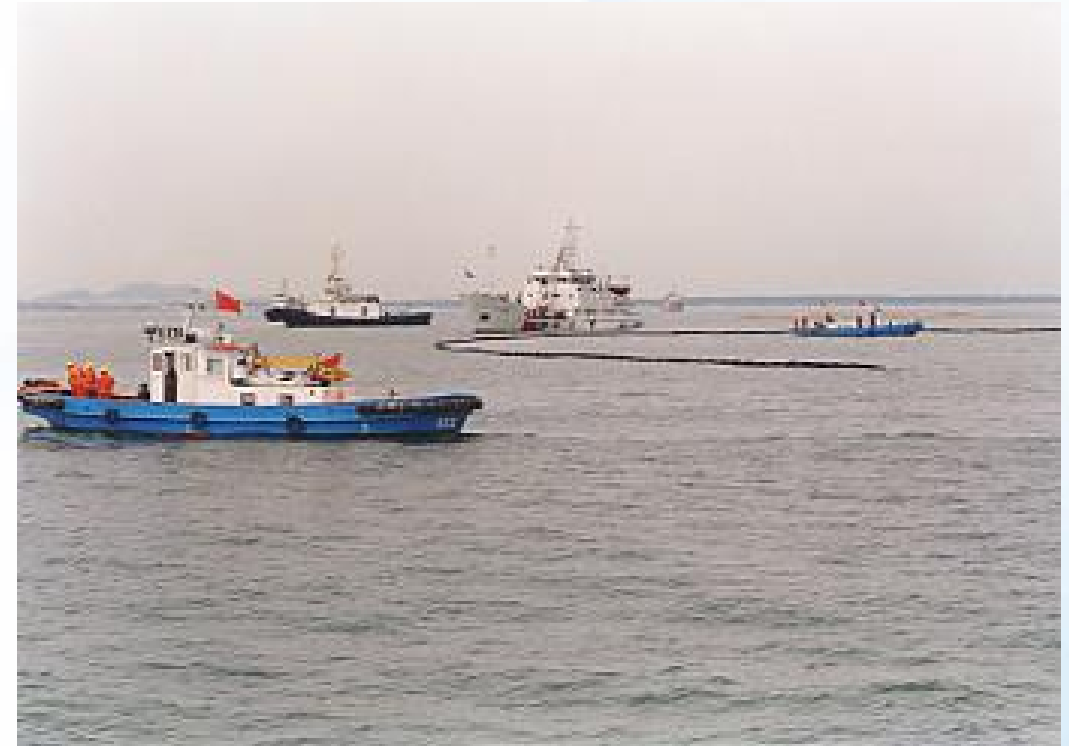
The searching and rescuing center at sea of Hebei Province