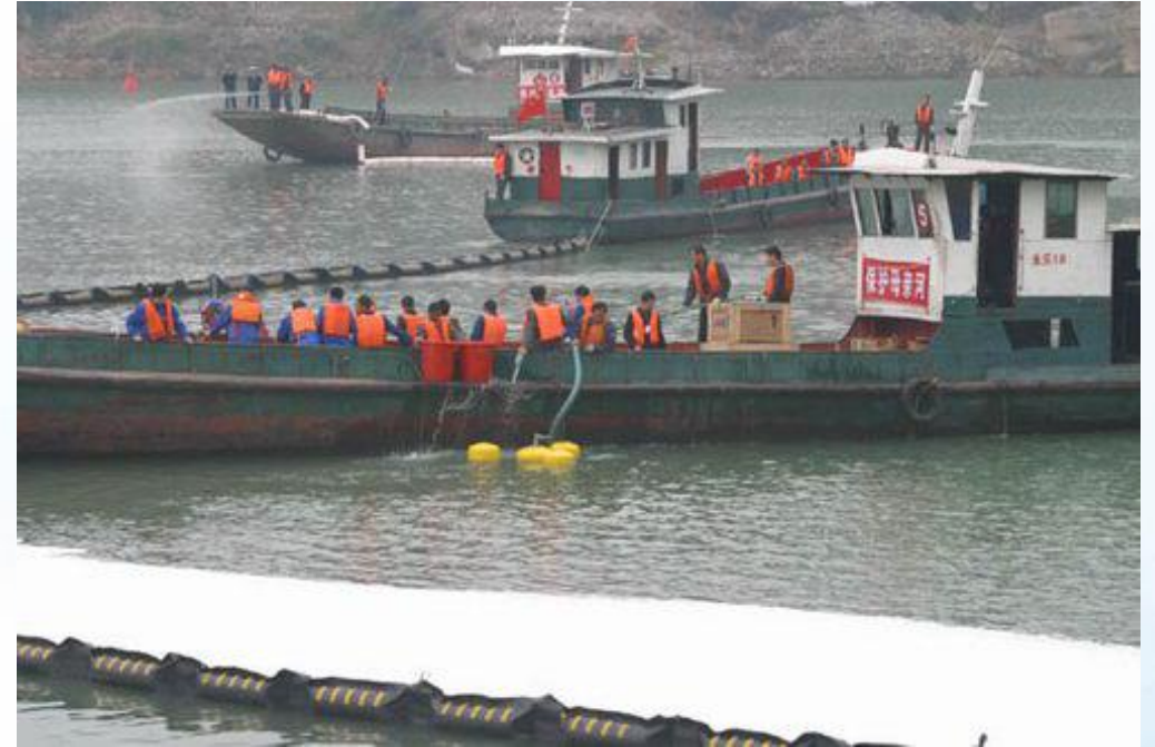
The drill on oil spill emergency in the Three Gorges Reservoir Area

★ In 2006, participating in the oil spill emergency response operation at the Qingdao port.