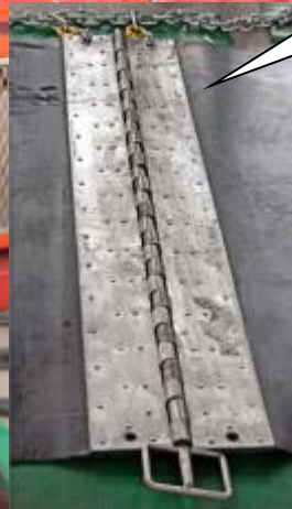
Hinge Pin Connector