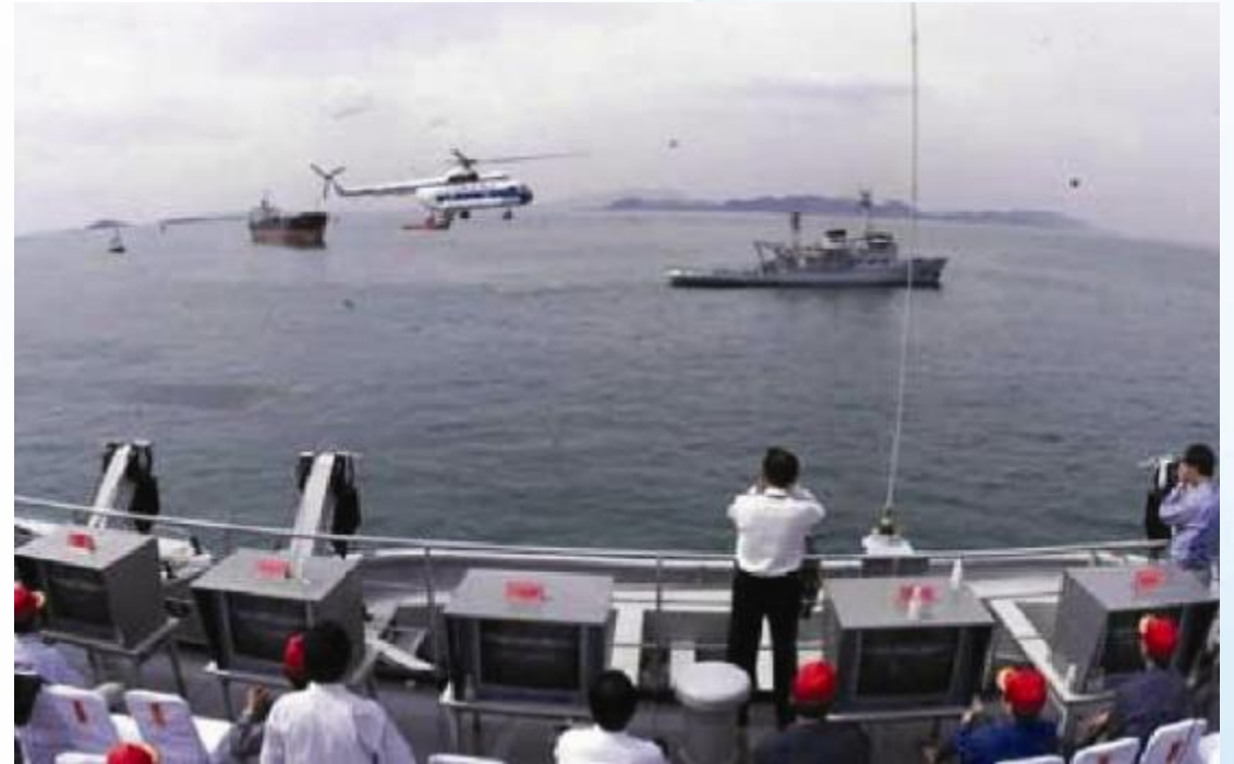
The drill on “Haijiu I”